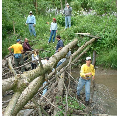
Volunteers during 2005 Rouge Rescue.

into the Koppernick section. This leisurely hour to 90-minute walk should provide a chance to see many spring wildflowers. No work this time, just a time to enjoy